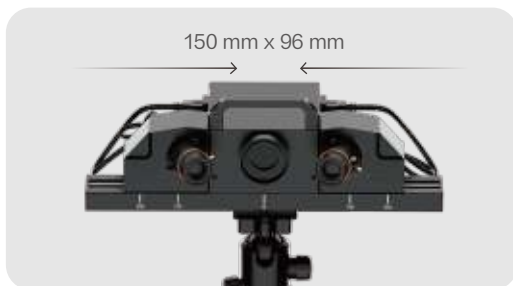
Inner Smaller Field of View for scanning small objects

The slide-rail design enables an easy switch of the scanning range between 150 mm x 96 mm and 300 mm x 190 mm meeting the needs of scanning objects of different sizes effectively.