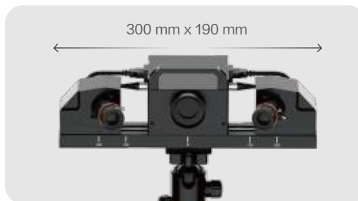
Outer Larger Field of View for scanning medium large objects